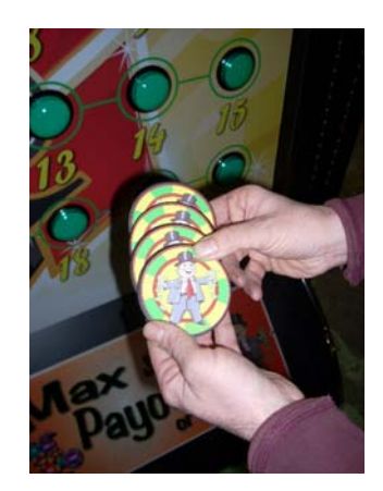
3. Player is Awarded Chips