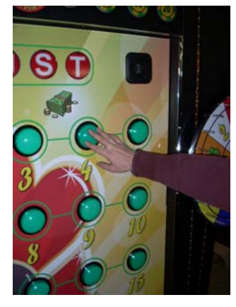
4. Player Pushes Buttons