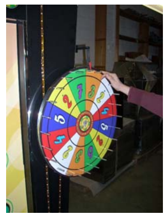
2. Player Spins the Wheel