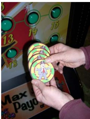
3. Player is Awarded Chips