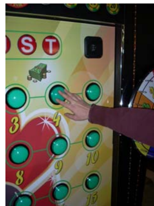
4. Player Pushes Buttons