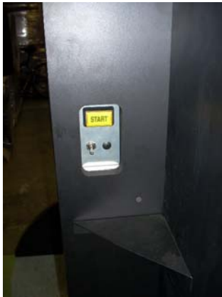
1. Operator Pushes Start

The player first spins the wheel to determine how many chances he gets to play. The game operator awards the player with the same number of player chips as indicated on the wheel. The player must then turn in one chip at a time to press any of the 20 buttons on the board. The player may choose to stop and take his prize at any time or continue as long as he has chips remaining. The player may also continue to play after going "Bust" as long as he has chips remaining. The player cannot press the same button twice or a warning tone will sound. This prevents them from claiming a prize that may have been forfeited earlier.