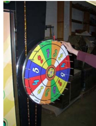
2. Player Spins the Wheel