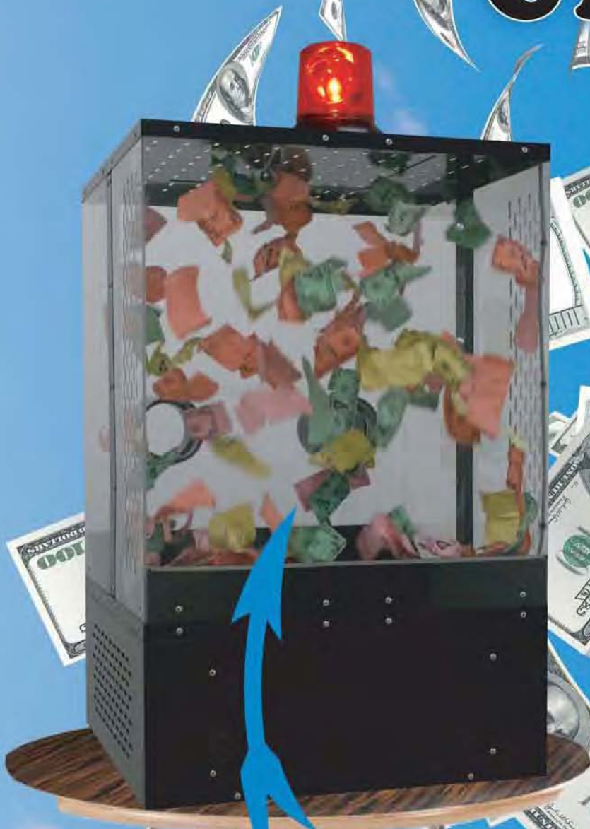
Table Top GRABBER